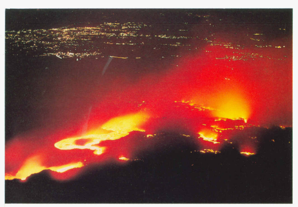
FIGURE 8. Nocturnal view of lava flows descending the upper flanks of Etna, overlooking the city of Catania, May 1983