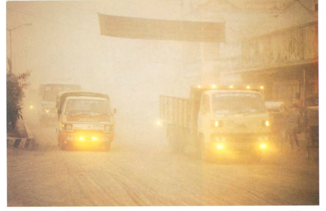
FIGURE 12. Visibility reduced by fine ash fall: eruption of Galunggung, August 1982